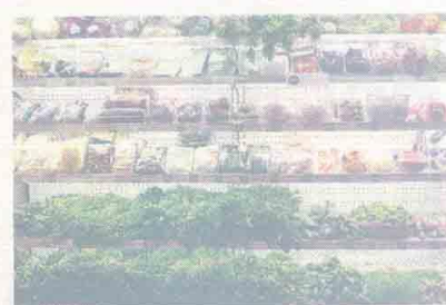
Exotic veggies for an avid foodle